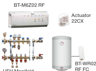
Up to 50 zone