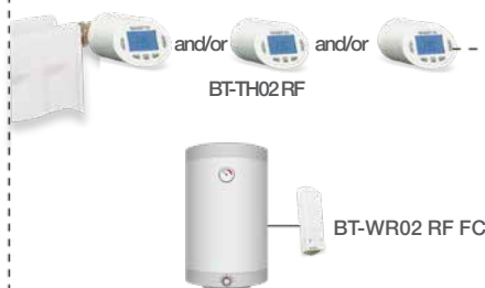
Up to 50 zone